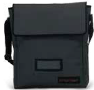
ST-3571 Optional carry bag