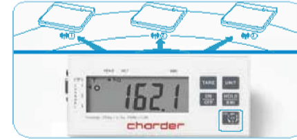
1 vs 3 wireless remote display.